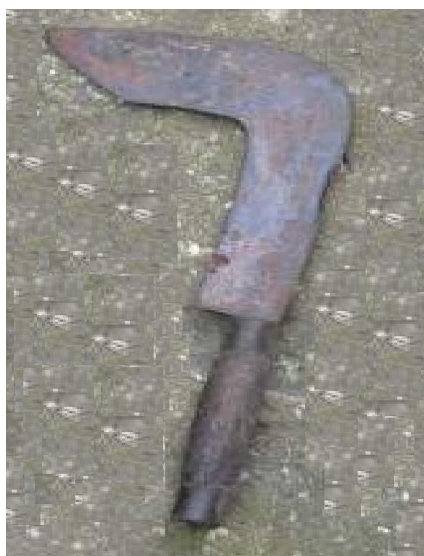
(Left) Unknown ' serpe ' from Givors (69700) (in the south of the Burgundy region). Note the sharpened tip to the beak and the two ferrules on the handle.

I have now come across three examples of similar shaped tools, but not sharpened like a billhook. The most recent was for sale in the 69 (Rhône) region, and has a handle with two ferrules, similar to that more usually found on the French cooper's ' cochoir '.