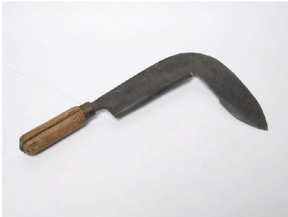
(Left) a ' serpe ' with a sharpened and pointed end

I had previously saved an image from the web of a similar tool, with a pointed beak and sharpened only on the section of blade next to the handle, but not on the rest of the blade.