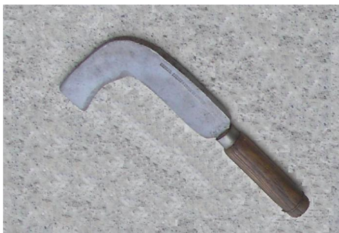
(Left) A French ' serpe à trellisage '.

The French trellis maker's billhook is similar to the Hampshire hurdle maker's, with a pronounced nose that allows it to be used to split or cleave the wood. The action is similar to that of a froe.